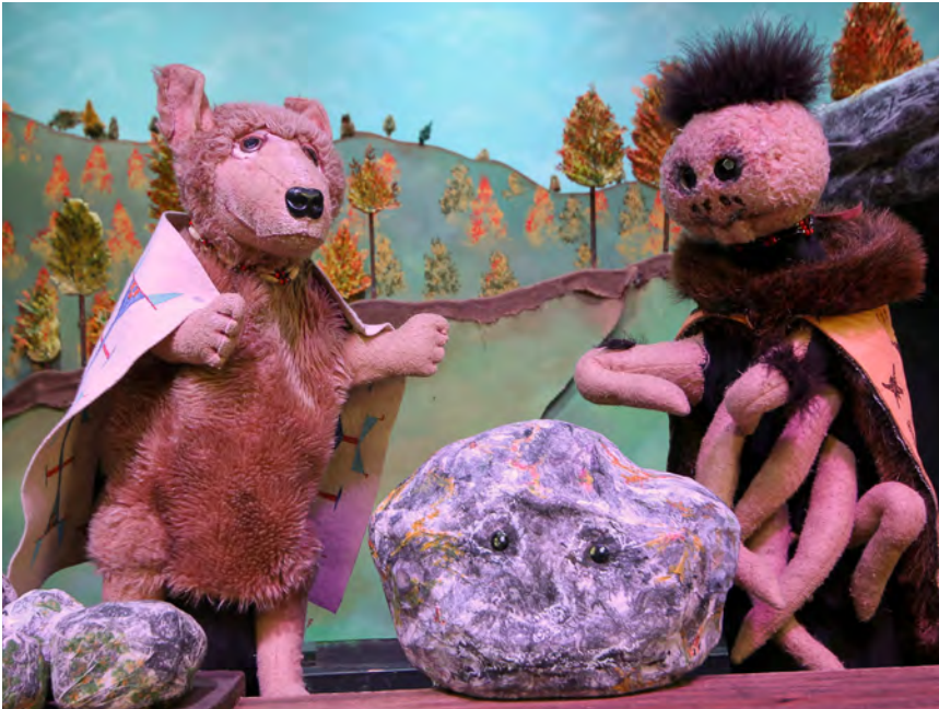
Coyote and his friend, Iktome, travel and meet a rock named Iya in the Lakota Sioux tale, Coyote's Giveaway, one of the shows Happy Hollow will feature on April 13.