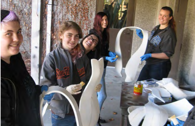
Sonoma State University students help build the five-headed dragon.