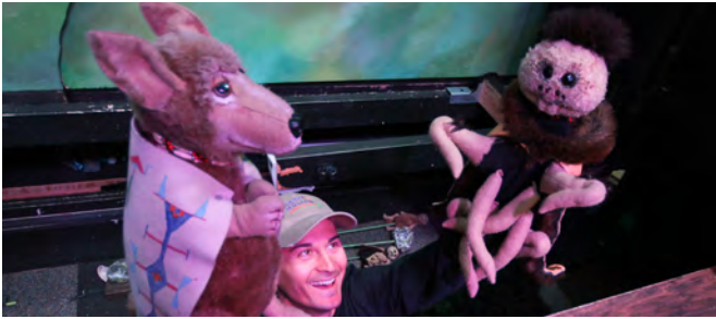
Behind the scenes of Coyote's Giveaway

The next SFBAPG meeting will be held at Happy Hollow Park and Zoo in San Jose.