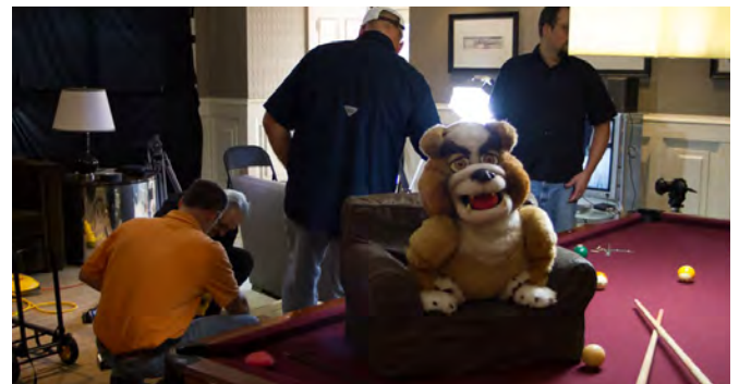
The spokesdog puppet at rest while the crew is setting up for the next shot.

The latest spokesperson for ADMC (American Distribution & Manufacturing) is a bulldog puppet designed and built at Images In Motion's Sonoma workshop. ADMC distributes pet products, among other things, and runs its own charitable organization, the Compassion For Pets Foundation, to support animal welfare charities.