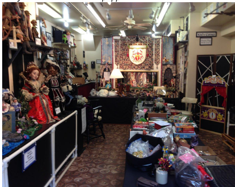
Pong's Pint Size Puppet Museum.